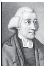
Words: 1776 Augustus M. Toplady (1740-1778)

http://www.hymntime.com/tch/html/r/o/c/rockages.htm