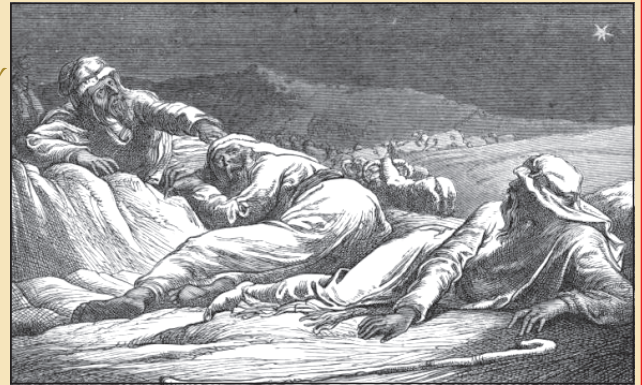
From Christmas Carols New and Old , 1871